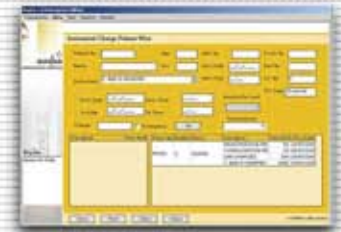
Inpatient Bill Estimate